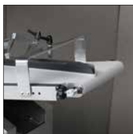
Adjustable pre-rounding Pre-round dough balls on the outfeed belt.