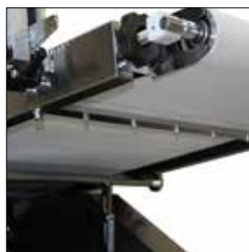
Outfeed belt scraper The belt is kept clean throughout use.