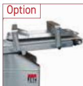
Option Moulding plate