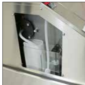
Oil recycling system Reduces oil consumption. Fitted with a filter and a low level alert.