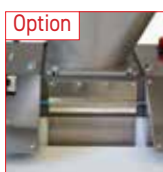
Option Dough piece lubrication