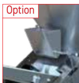
Option Built-in flour dispenser Prevents the dough pieces from sticking to the belt.